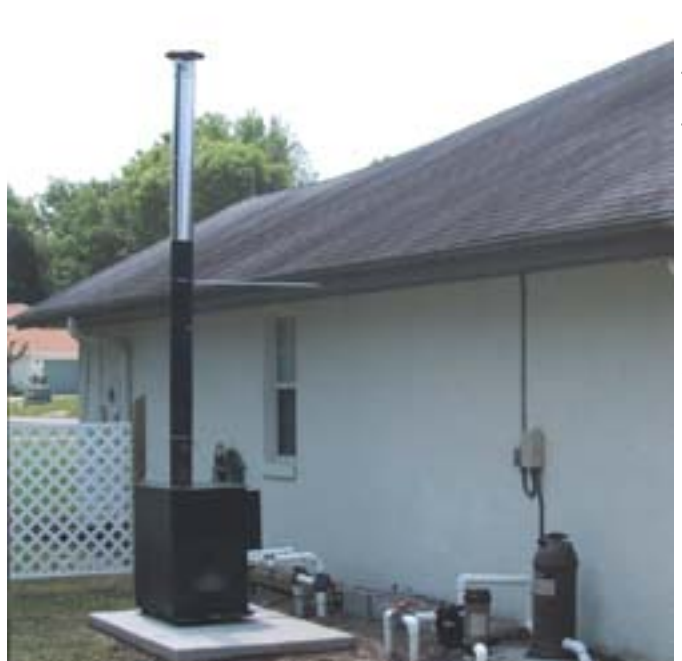
temperature back up.

I had your heater for two full seasons and am very pleased with its performance. Thanks to you, I can now start the swimming season about a month earlier. In just two days time I can increase the temperature of the water to 85 degrees Fahrenheit, and if a cold spell comes during the season I can easily bring the