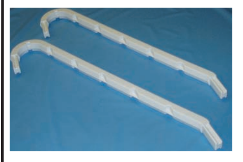
G. HANDRAILS (2) (AC STEPRAIL)