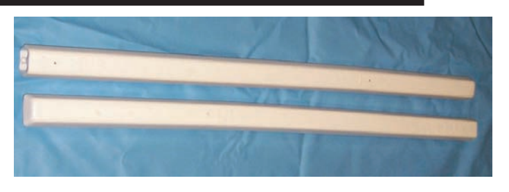
B. SHORT HANDRAIL POST (2) (AC SHORTPOS)