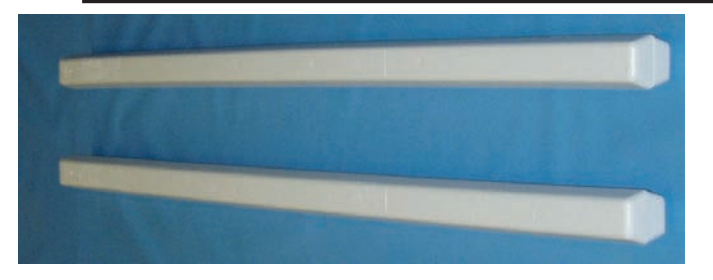
A. LONG HANDRAIL POST (2) (AC LONGPOS)