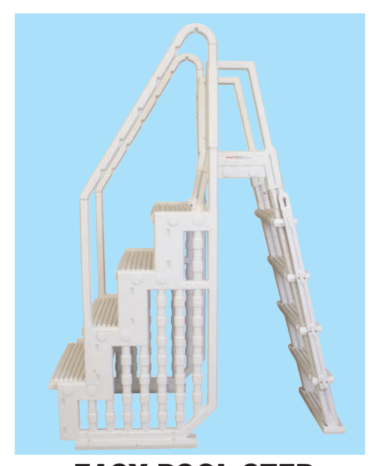
EASY POOL STEP WITH OUTSIDE LADDER (NE126)