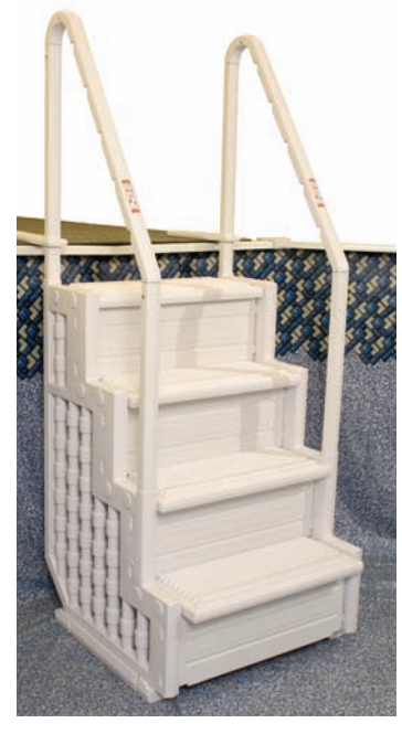
EASY POOL STEP (NE113) (1 CARTON)