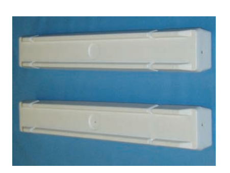
E. BASES (2) (AC BASE)