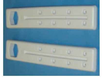
F. MOUNTING BRACKETS (2) (AC MTBRACK)