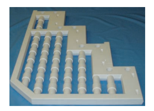
H. SIDE PANELS (2) (AC PANELS)