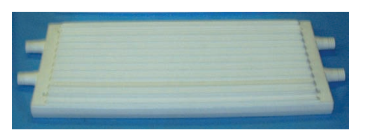
C. STEPS (4) (AC STEPS)