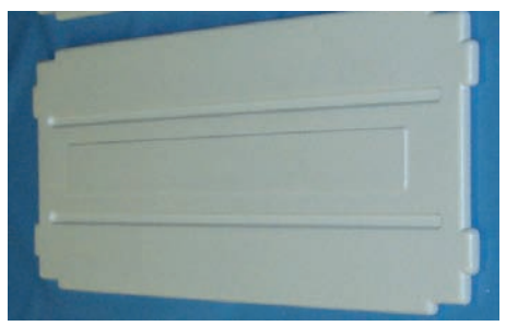
D. RISERS (4) (AC RISERS)