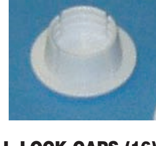
I. LOCK CAPS (16) (AC LOCKCAP)