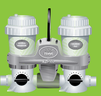
XL PRO In Ground System with X-tended Pac Life up to 40,000 Gallons